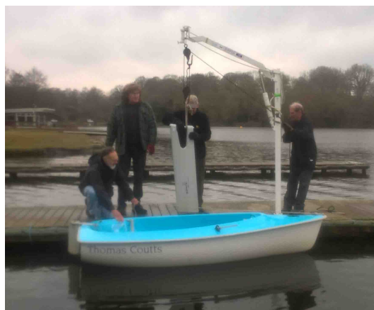
The keel hauling team hard at work