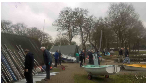
Booms & rudders lined up & ready for fitting

Thursday 24 th March was Fitting Out day and a record turnout of almost 50 helpers worked hard in cool and increasingly wet conditions, cleaning and rigging the Sailability fleet, checking the club trailers and tidying the Pavilion and storage sheds in preparation for the start of the new season.